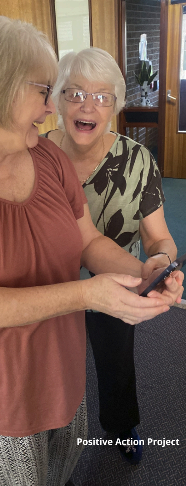
Positive Action Project