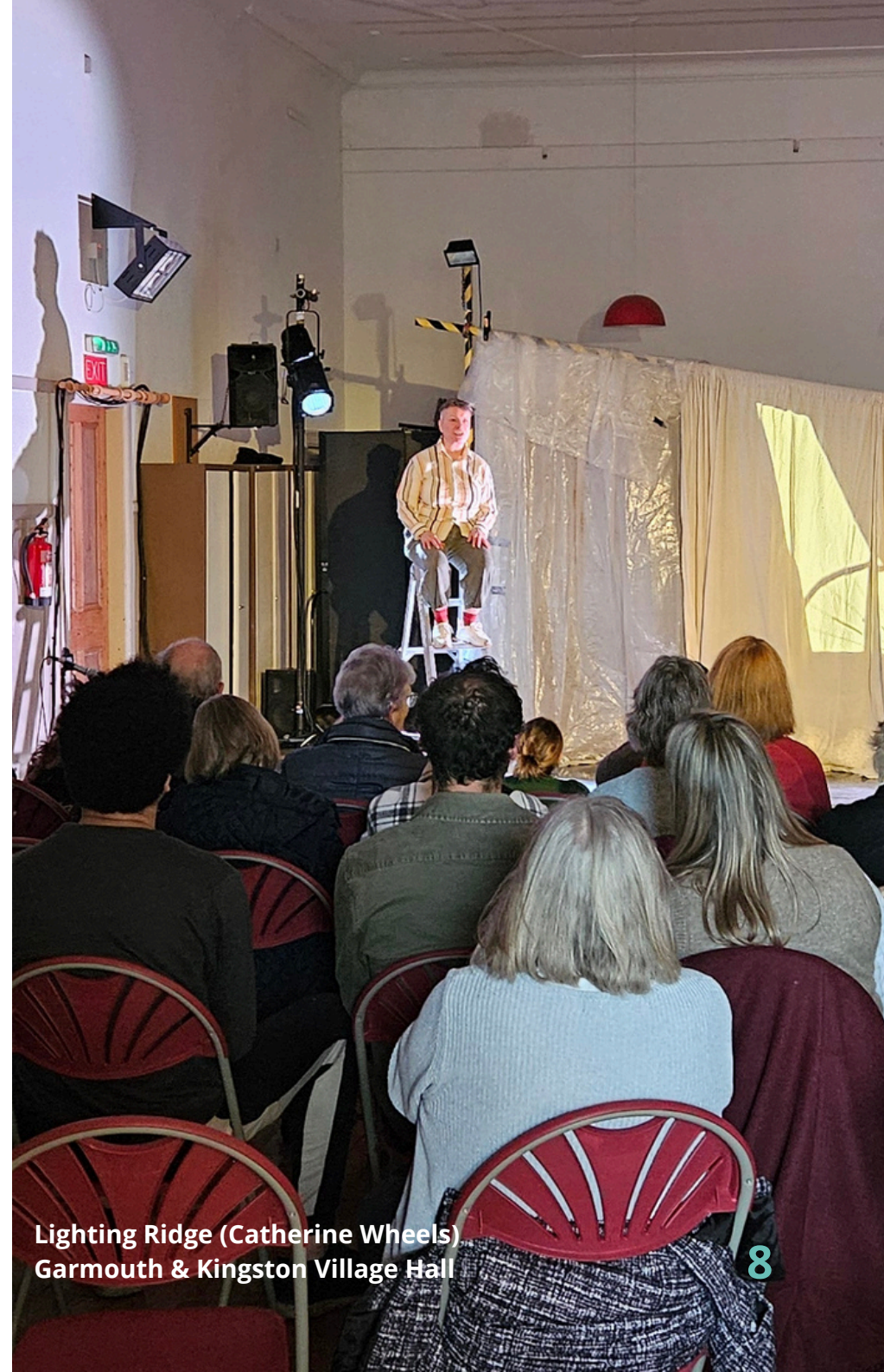
Lighting Ridge (Catherine Wheels) Garmouth & Kington Village Hall